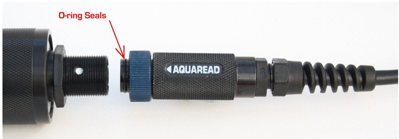
Seals at Aquaprobe end

The Aquaprobe Extension Cable features high-pressure metal connectors, which incorporate several O-ring seals. Prior to first connection, the seals must be lubricated using the silicone grease supplied with the Aquaprobe.